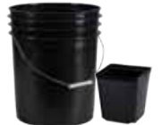
Clean plastic plant pots & 5 gallon buckets