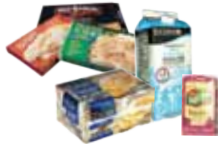
Cartons, frozen food & juice boxes