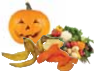
Fruit & vegetable scraps; leftovers; pumpkins