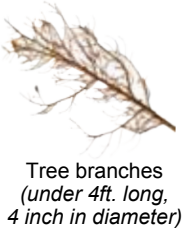
Tree branches (under 4ft. long, 4 inch in diameter)