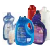
Plastic bottles (all colors)