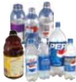
Milk, water, juice & pop bottles