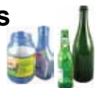
Bottles & jars (empty & rinse, labels ok)