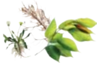
Grass clippings, weeds, leaves, twigs, branches & roots from pruning